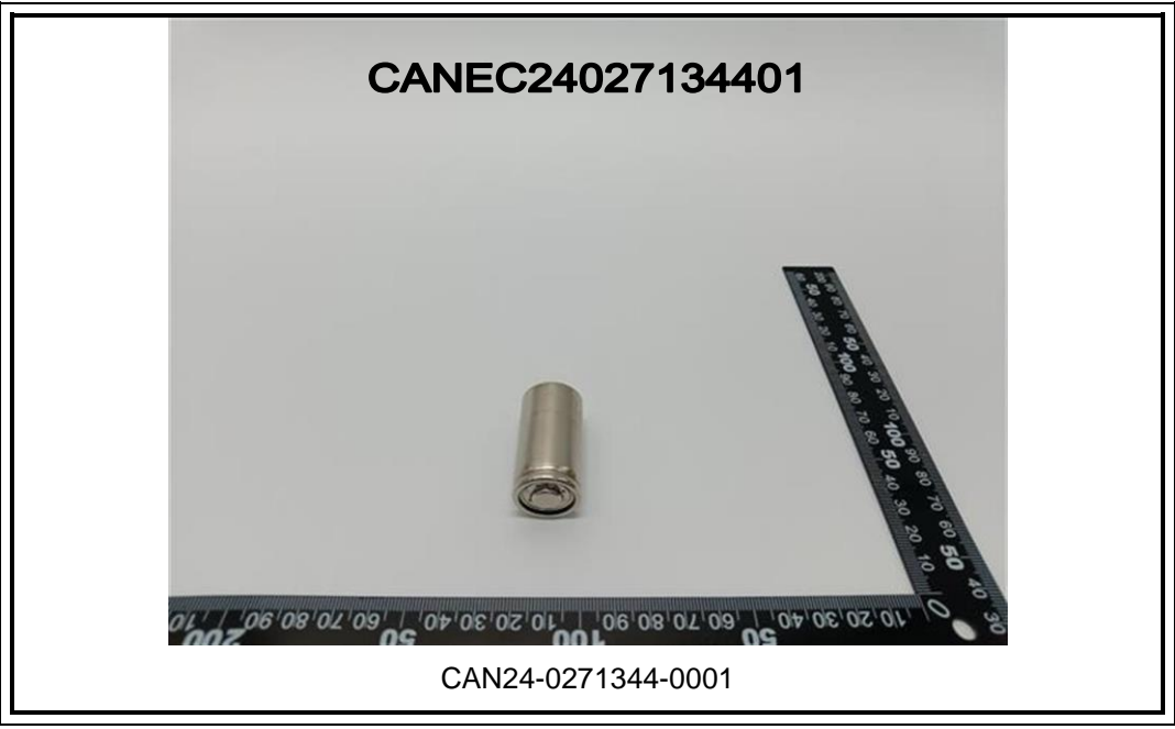
SGS authenticate the photo on original report only *** End of Report ***